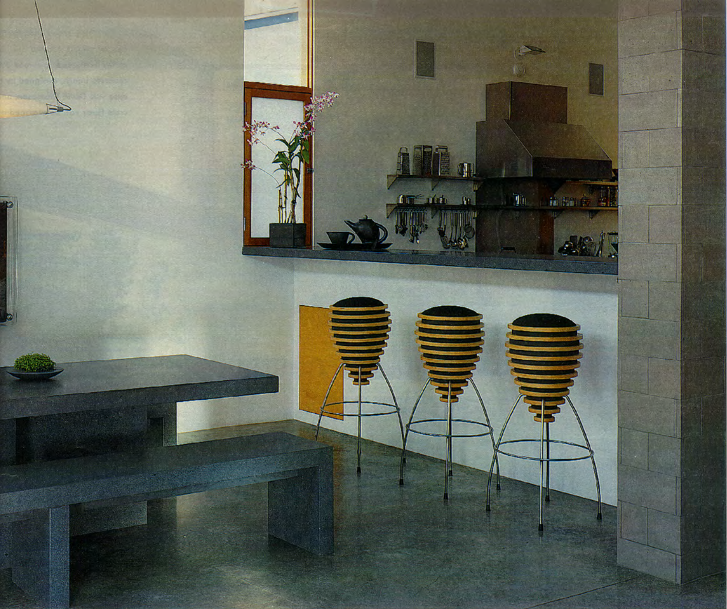
bove: Near the Syndecrete dining table and benches are a wall terrarium by Santa Monica artist Dodd Hollisapple and steel, wood and rubber stools by Krab Design. ow: Max, 10 months, relaxes on the master bedroom's Douglas fir platform bed. With no forced-air heating to accommodate, Hertz gained space for exposed ceilings.